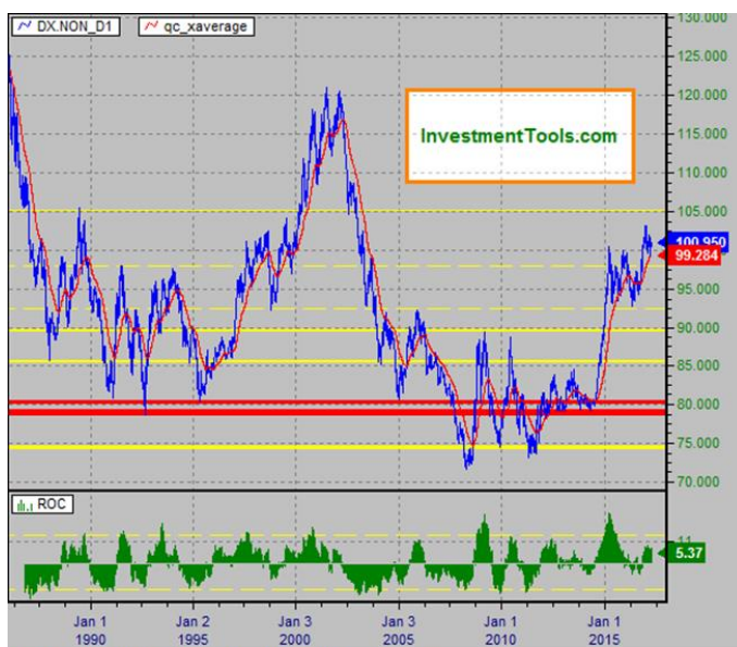
Chart created with NeoTicker EOD © 1998-2009 TickQuest Inc.

Meanwhile, a make up of the basket is overdue for revision, as China in particular has emerged to a major trading partner in the last ten years.